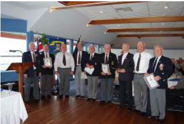
New Life Members receive their Certificates.....