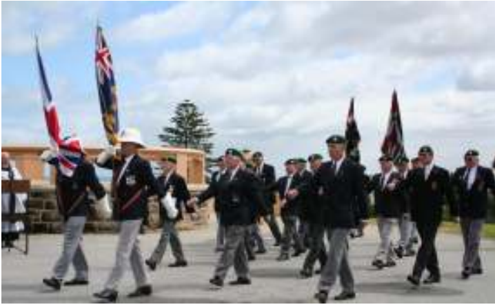
A Proud band of Brethren in Arms.....