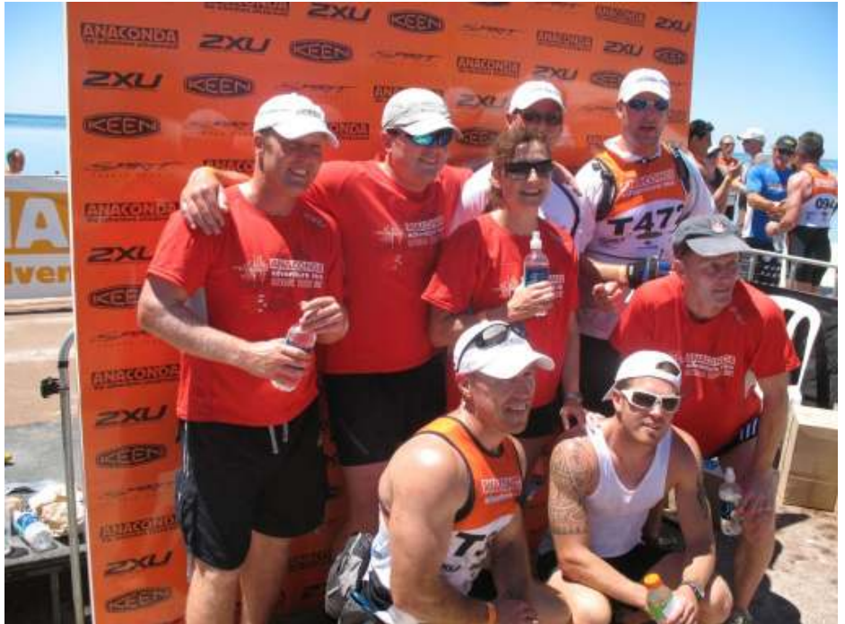
Teams Anacommando and Airborne Forces.....

http://www.rapidascent.com.au/PDF/WAProgram.pdf