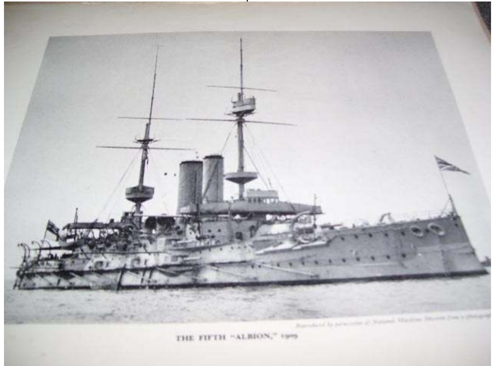
The 5 th Albion, launched 1895

The sixth Albion was a steam propelled aircraft carrier which although laid down in 1944 during the Second World War was not completed until ten years later. She was the first aircraft carrier in the world to have an aid to deck landing known as "the mirror" fitted. Her jet aircraft and their weapons were what in those days were known as "conventional" as compared to "atomic". She seems to have covered most of the world in her time, but by modern standards appears to have been quite appallingly hot,