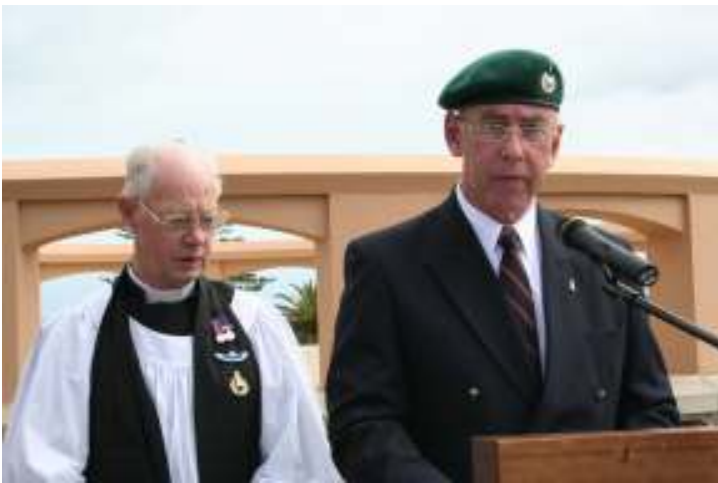
.....well, you've got to, don't you?.....