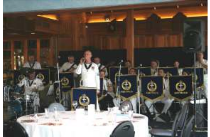
The Royal Australian Navy Band (WA Det) supported the RMA WA at both the Parade and Luncheon....