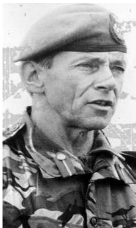
General Sir Jeremy Moore